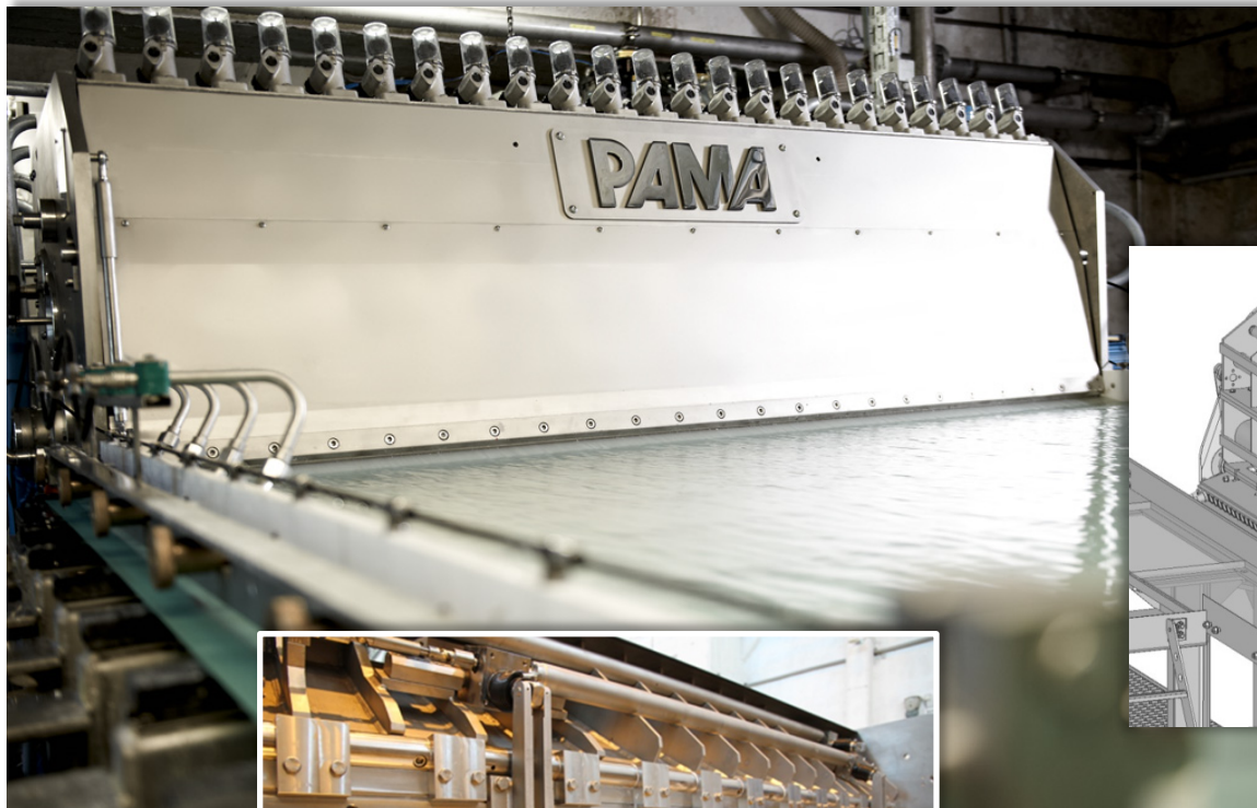
Rectifier roll-type headbox